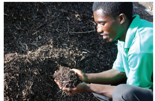
Building Good Soil Improves Crop Yields